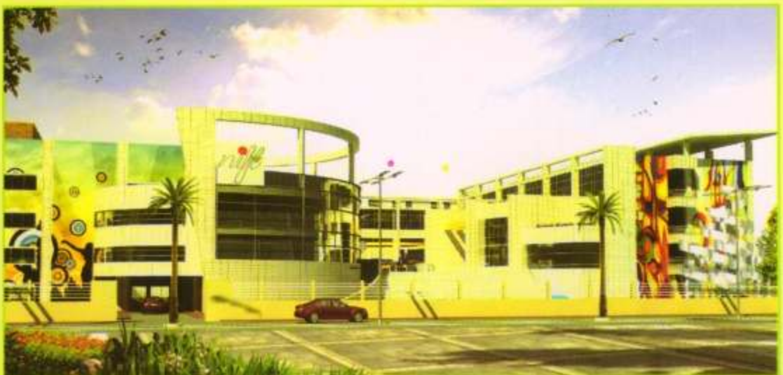
Design of NIFT, Patna

Construction of Permanent NIFT Campus, Located at Mithapur, Patna is going on. Total available land for construction is 6 acres. Total estimated cost is ₹ 4193 Lacs and expected date of completion is 29-08-2012.