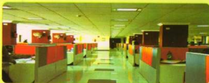
RCD OFFICE, PATNA