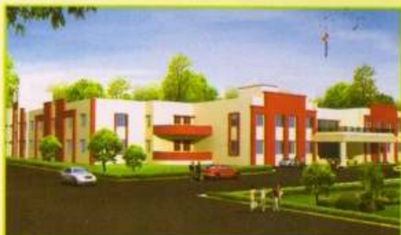
Design of Administrative Block of NCE, Chandi

Construction of Nalanda College of Engineering, Chandi, Nalanda is going on. Total available land for construction is 51 acres. Total estimated cost for Phase-I is ₹ 2904.78 Lacs.