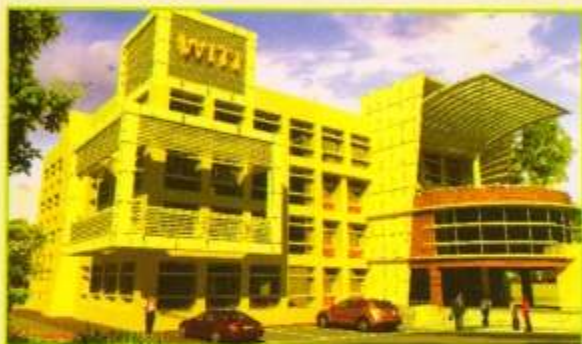
Design of WITI, Patna

Construction of WITI, Digha, Patna is going on. Total available land for construction is 3 acres. Total estimated cost is ₹ 640.94 Lacs.