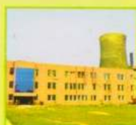
Agriculture Office Mithapur, Patna