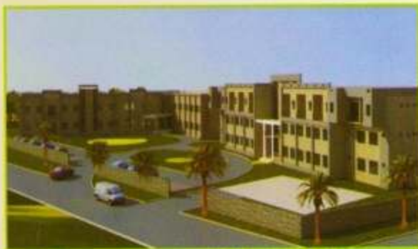
Design of BAMETI, PATNA

Construction of Bameti (Bihar Agricultural Management Extension and Training Institute) is proposed at Patna. Total available land for construction is 2.10 Acres and total estimated cost is ₹1550 Lacs.